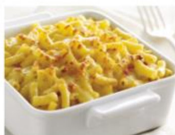
WEDNESDAY: Mac & Cheese