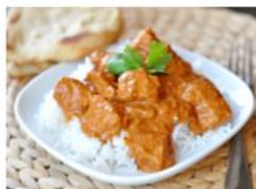
THURSDAY: Butter Chicken