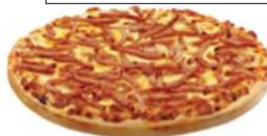
MONDAY: Ham & Cheese Pizza