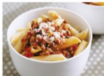
TUESDAY: Pasta Bolognaise